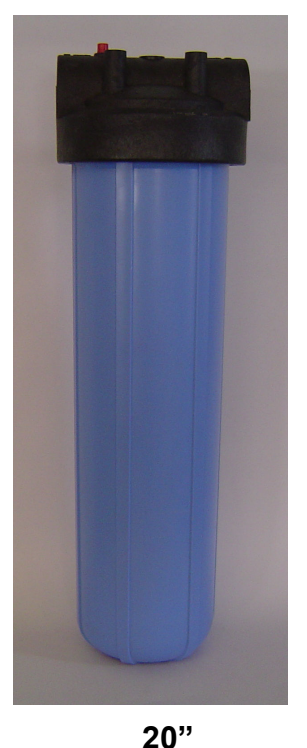
Rated for up to 90 psi

NO10BB25 (OPAQUE 1" PORTS) NO10BBCL25 (CLEAR 1" PORTS) NO10BB38 (OPAQUE 1½" PORTS)