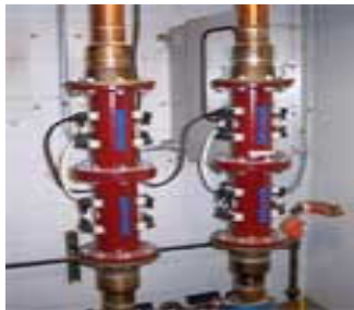
Example of a typical installation